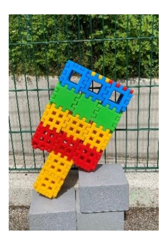
Scoil Phádraig Naofa